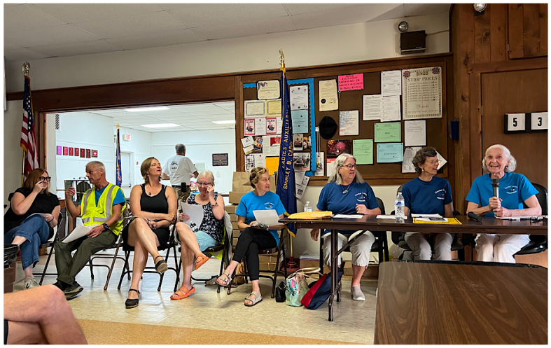
Annual General Meeting at the VFW Hall

We saw some of the highest lake levels ever! Pieces of dock floated away and boats left their moorings and floated ownerless across the water. One resident had a good solution!