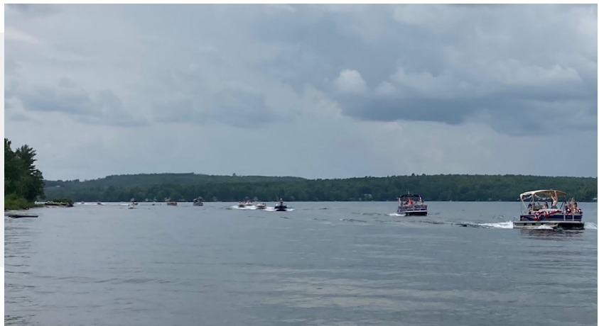
Here they Come!! The 4th of July Boat Parade