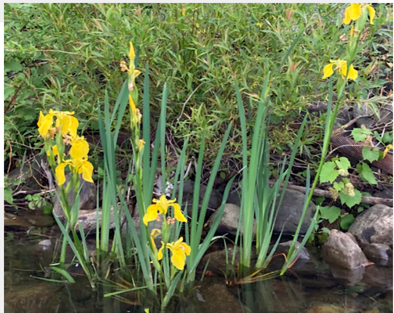
Invasive Yellow Water Iris by the causeway